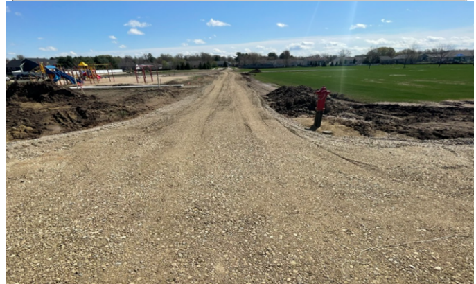
10' walk being prepped