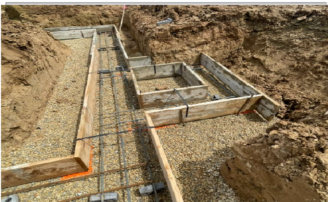
Bath house footings being formed