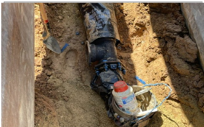
6" DI watermain tie in @ windmill ridge