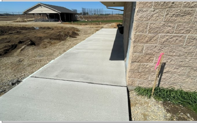
Stoop poured in front of existing bathrooms