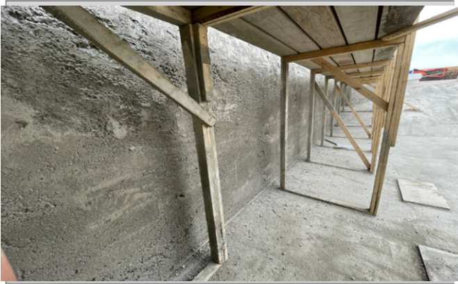
Lower portion of lap pool wall shot crete completed