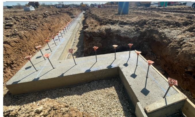
Bath house footings on South half poured