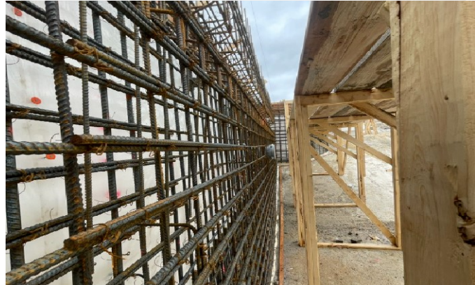
Lap pool wall rebar