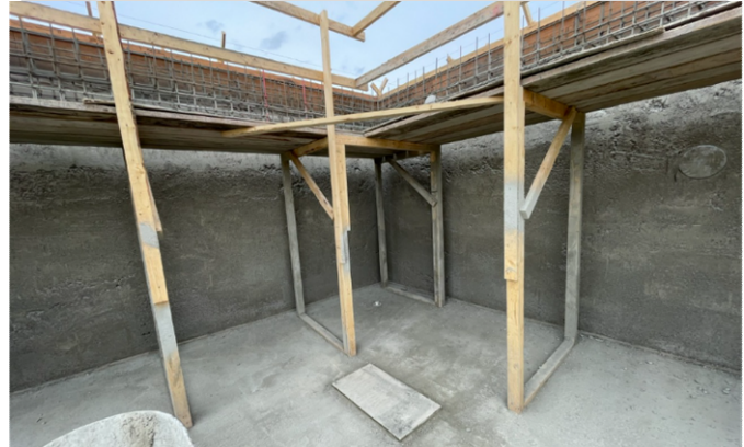
Lap pool wall shot crete completed