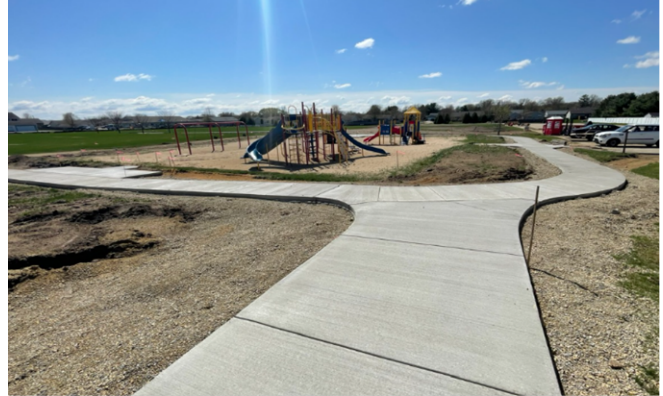
Sidewalks around playground