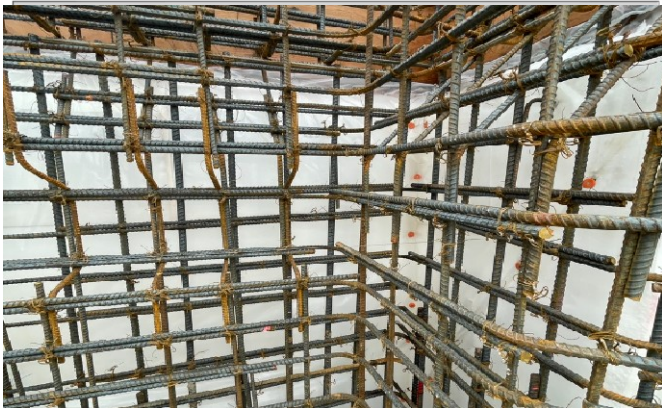
Lap pool wall rebar @ toe ledge