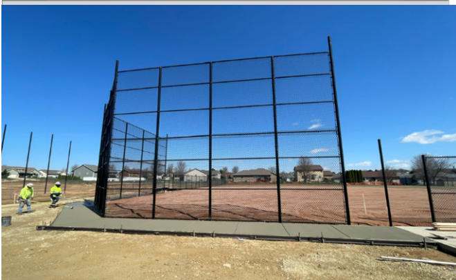
Fence stretched on backstop @ softball field - 5' walk poured for working space